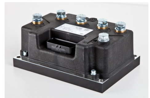
Schabmueller MI02 Motor Controller